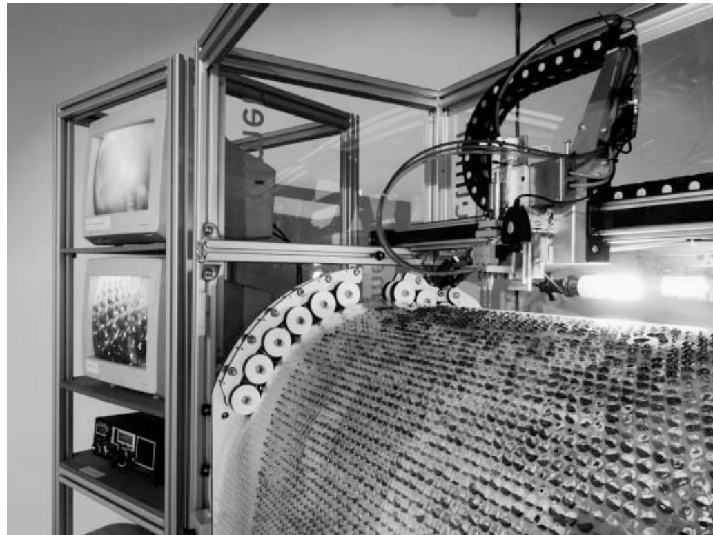
Figure 3: Gebhard Sengmüller, VSS7V , plotter detail, 2006