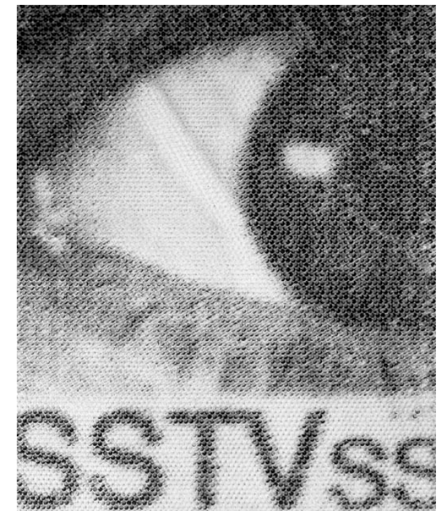
Figure 4: Gebhard Sengmüller, VSSTV , printout detail, 2006

GS: In the beginning—around 1998 or 1999—I had the idea of doing something with bubble wrap, this omnipresent packaging material. The structure of this material resembles that of a television’s cathode ray picture tube under a microscope. It has the same honeycomb pattern and round, pixel-shaped dots. I wanted to construct a machine that would fill these individual bubbles with colored ink and thus turn the sheet of bubble wrap into a kind of large television